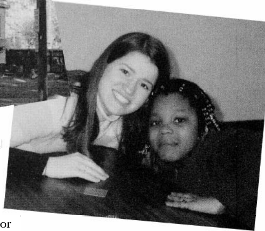
Volunteer tutors and the children enjoy the afterschool tutoring program at Washington Street Mission.

Mission have changed as well. We no longer offer shelter or meals or nightly Gospel services, but we continue to reach out to people in need with the message of Jesus Christ by meeting spiritual and physical needs.