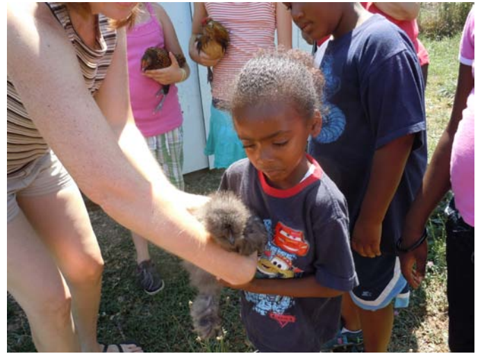
Holding a chicken at a farm is a new experience for one of the children (and it's a little scary). They were also able to milk a goat, pet a horse and eat some goat's milk ice cream.