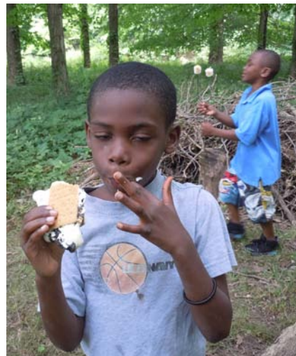
A hot sunny afternoon at the home of a long-time tutor included swimming in the pool, roasting hot dogs over a fire and making sticky, gooey s'mores. The children really enjoyed the swimming (it was difficult to get them out of the pool).