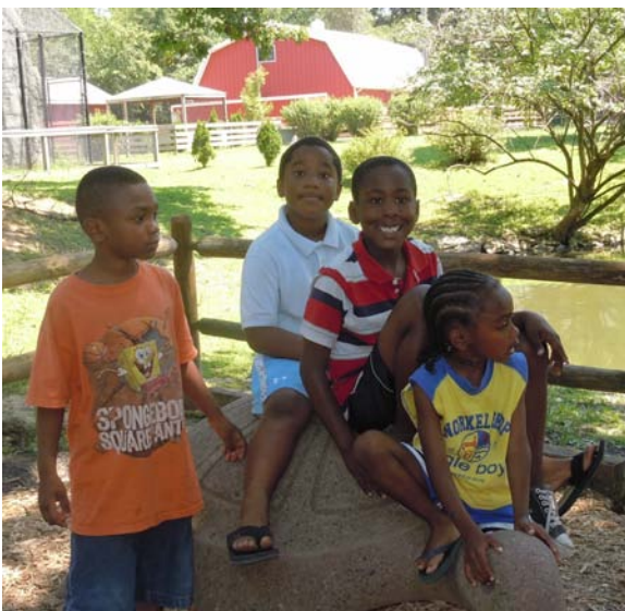
The children pose on the stone turtle after visiting the zoo.

A variety of summer activities enrich and motivate the children involved in the Mission's afterschool tutoring program. When they have trouble concentrating on homework during the school year, they often tell each other, "You may not be able to do summer fun next summer." They look forward to activities like these all year.