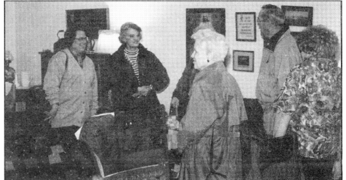
Visitors in the Mission's parlor enjoy telling and hearing stories during the anniversary open house about the history of God's faithfulness to this ministry over the years.

Many people commented that they had not visited the Mission in a long time and were impressed by the size and versatility of the facilities and by the extent of the ministries here.